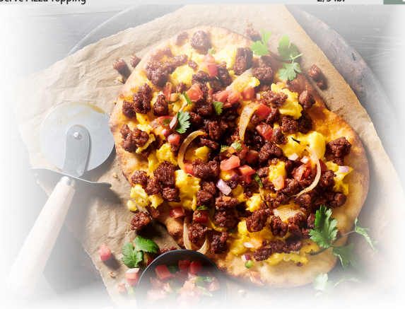
10000041301 Hillshire Farm® All Natural! Pork Chorizo Crumbles