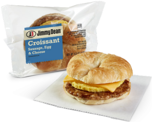
10000011802 Jimmy Dean® Sausage, Egg & Cheese Croissant Breakfast Sandwich