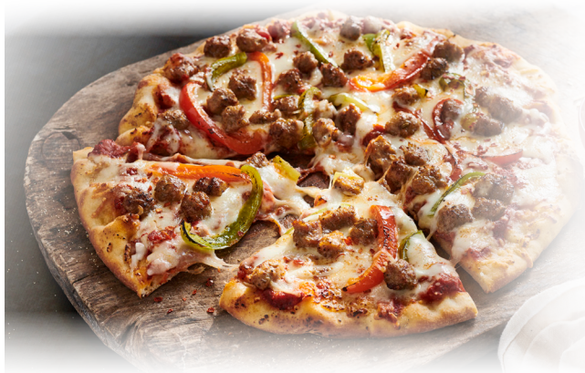
10015480393 Hillshire Farm® Pork Crumbles with Italian Style Seasonings, Large, 14 pieces/oz.