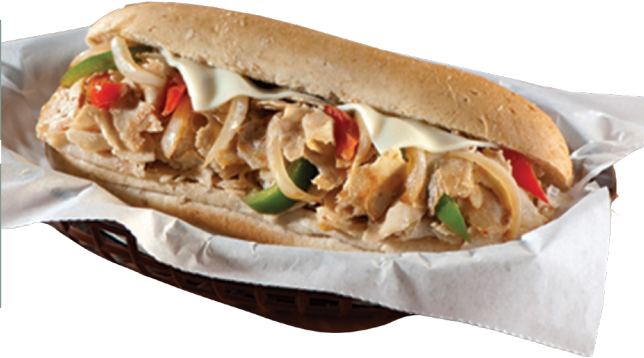
10000045040 Philly Freedom® Uncooked (UC) Traditional Chicken Flat Steak, Marinated, 4 oz.