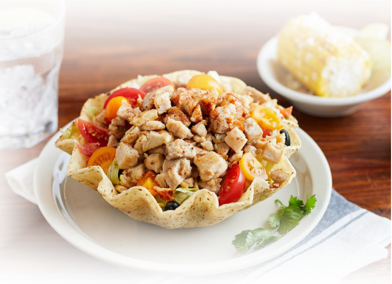
10228300928 Tyson Red Label® Fully Cooked (FC) All Natural 1 Low Sodium Diced Natural Proportion, 60/40 White/Dark Meat, 1/2"