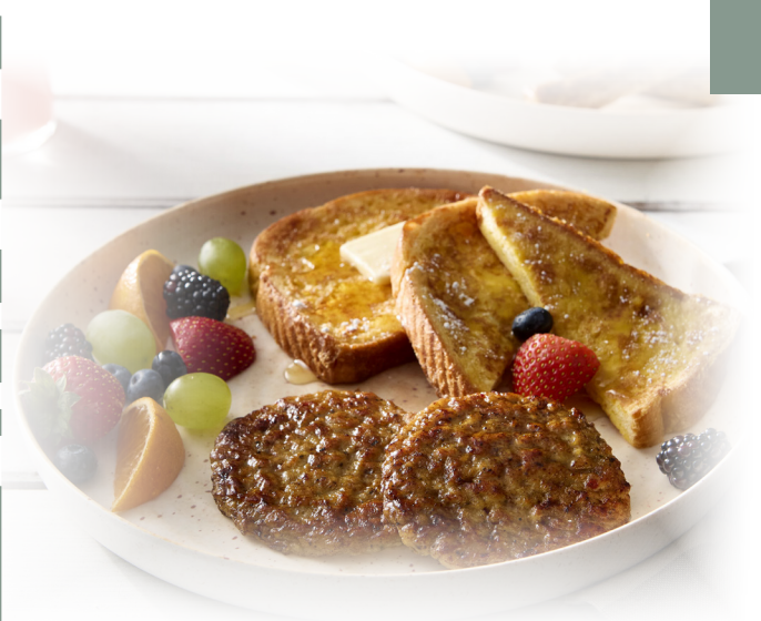
10000012895 Jimmy Dean® Fully Cooked (FC) Chicken Sausage Patties, 1.5 oz.