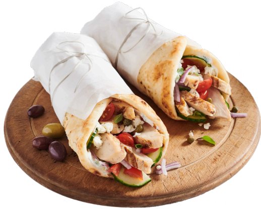
10000045091 Tyson Red Label® Fully Cooked (FC) Wood Fire Seasoned Breast Strips