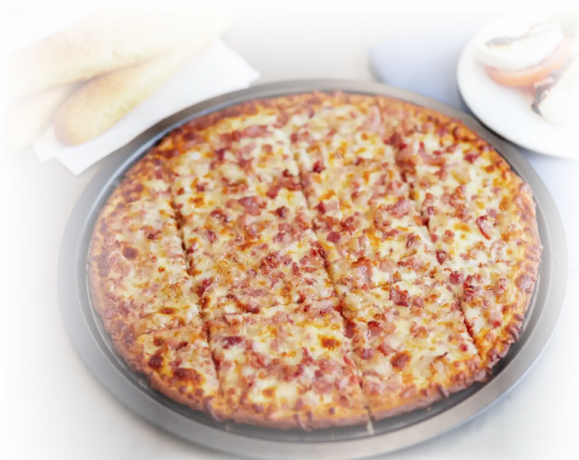
10240300269 Hillshire Farm® Bakin' Bacon™ Heat-N-Serve Pizza Topping