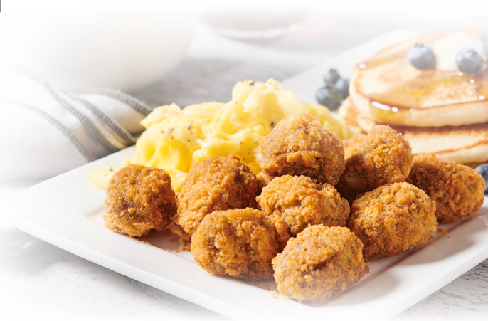
10000042302 Jimmy Dean® Fully Cooked (FC) Sausage Tots