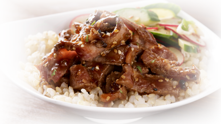
10000039686 Tyson Red Label® Fully Cooked (FC) Authentic Grilled Whole Muscle Nuggets